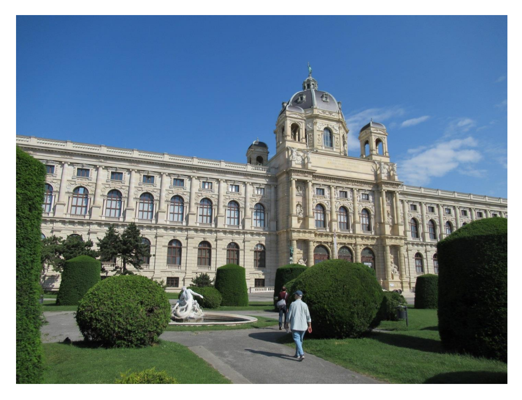
Figure 1 . A partial view of the exterior of the Natural History Museum. The entrance is below the center rotunda.