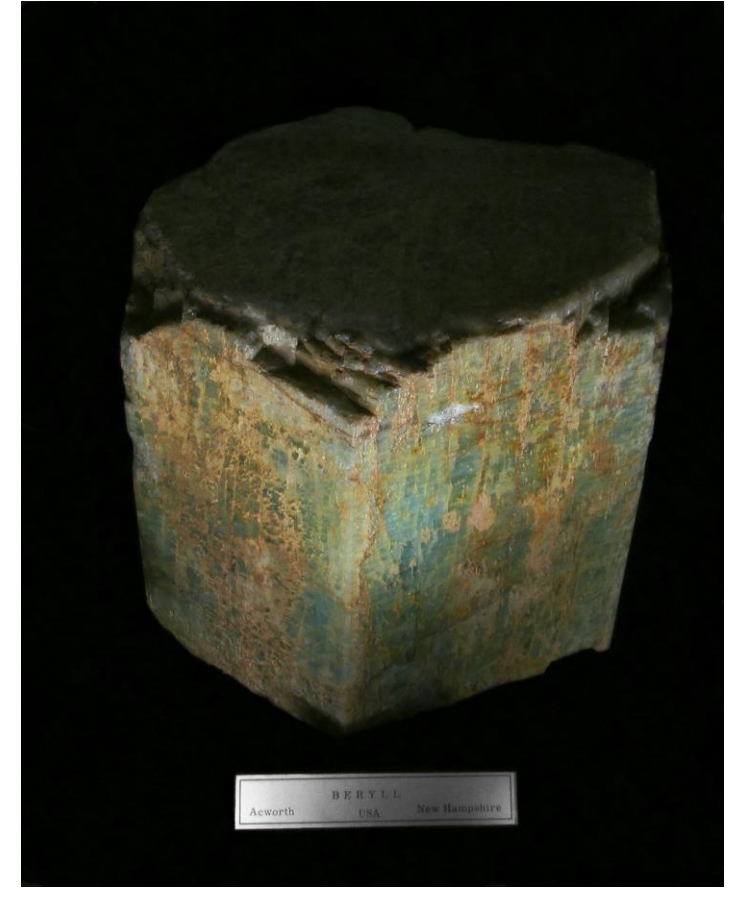
Figure 4 . This is the specimen that Charles T. Jackson viewed in 1831 in Vienna and described a decade later.

Figure 3 . View of the interior of Room 4 near the end of cabinet 30 with the Acworth beryl (and the author as a size reference). Other systematic cabinets and wall displays can be seen in the background.