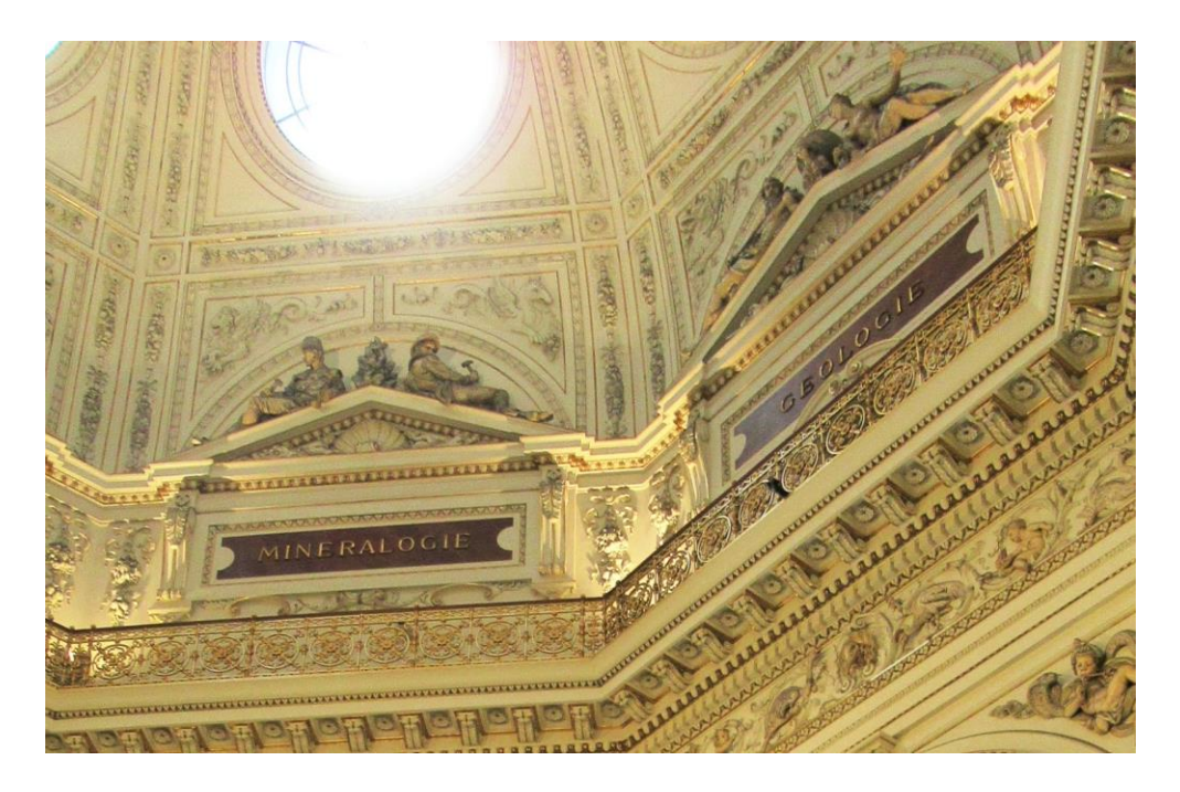
Figure 2 . Under the rotunda is an octagonal room. Each wall identifies a branch of science celebrated in the museum. These two walls identify mineralogy and geology, part of the extraordinary view looking up while enjoying Sachertorte and coffee in the Dome Hall lunchroom. Photographed May 2018 by the author.

Figure 1 . A partial view of the exterior of the Natural History Museum. The entrance is below the center rotunda. Photographed May 2018 by the author.