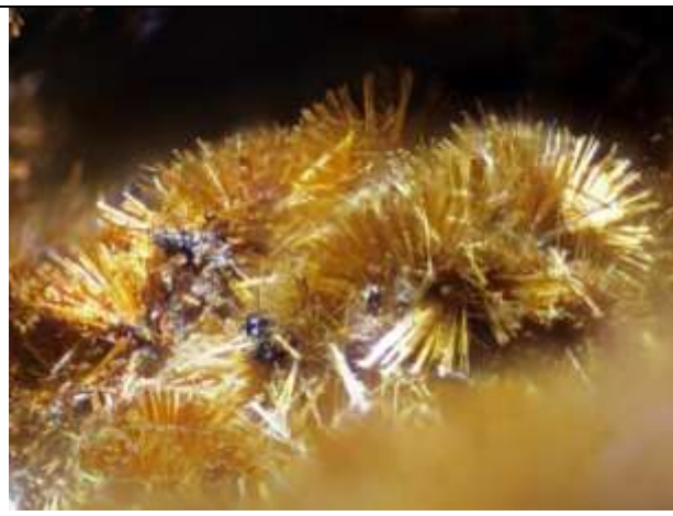
Figure 2: Beraunite Chickering Mine, Walpole, NH 1.1 mm field of view