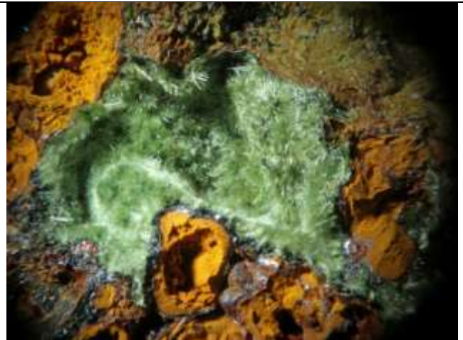
Figure 3: Ferroberaunite Palermo #1 Mine, Groton NH 6 mm field of view

Jim Nizamoff forwarded the following thoughts on this topic after reviewing this brief article: