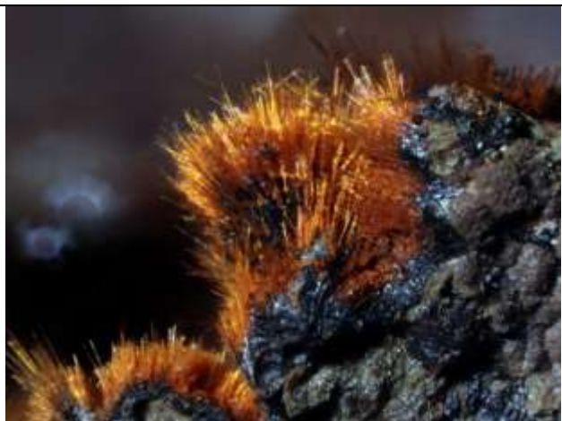
Figure 1: Beraunite Palermo Mine, Groton, NH 3.5 mm field of view

Figures 1 and 2 illustrate the species that the IMA now defines as beraunite. These specimens were previously labeled as eleonorite in my collection.